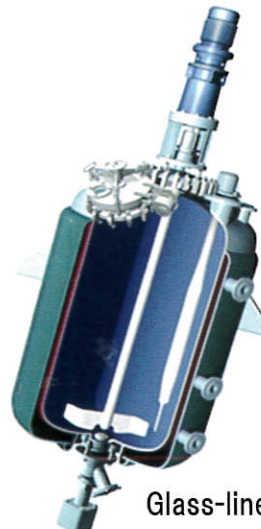
Glass-lined Reactor & Storage Tank

Kobelco Eco-Solutions was the first to produce glass-lined heat exchangers.