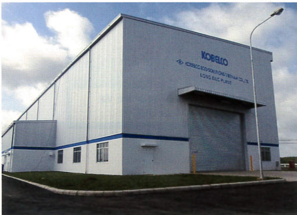
Manufacturing Bldg. Area of a site : 10,000m 2