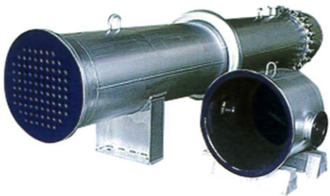
Glass-lined heat exchanger

Glass lined Product has long been used in producing composite materials constructed of steel and glass in a wide range of fields, which include the chemical and food manufacturing industries where products of high chemical resistance and high purity are required.