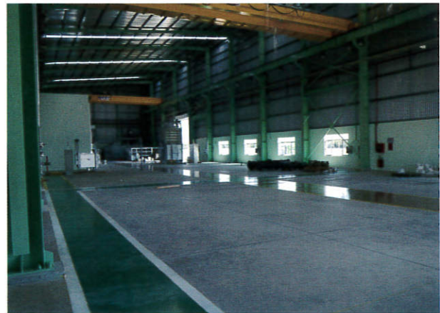
Manufacturing Bldg.(inside) Area of buildings : 3,000m 2