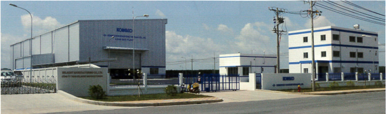
Manufacturing Bldg. & Office Bldg.